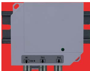
DIN rail mounr